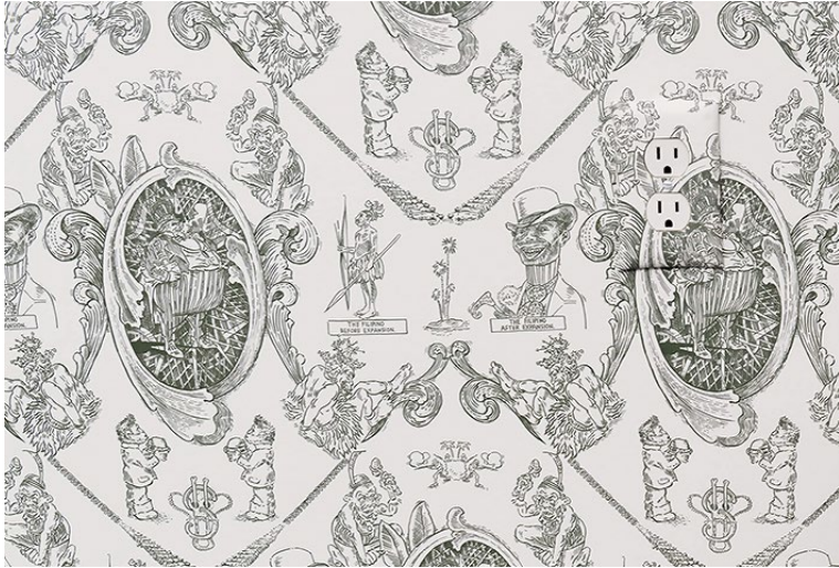
Maryrose Cobarrubias Mendoza